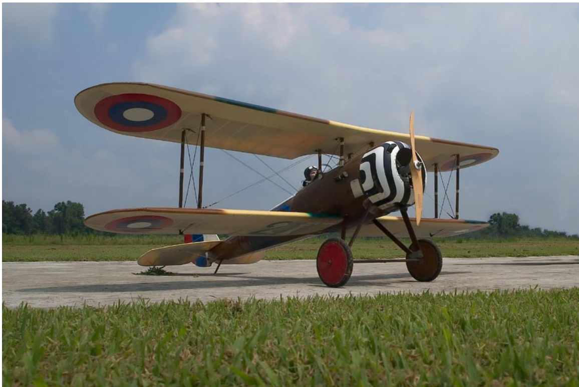
A fine looking Nieuport 28 at the Scale Fly-In. Owner unknown.