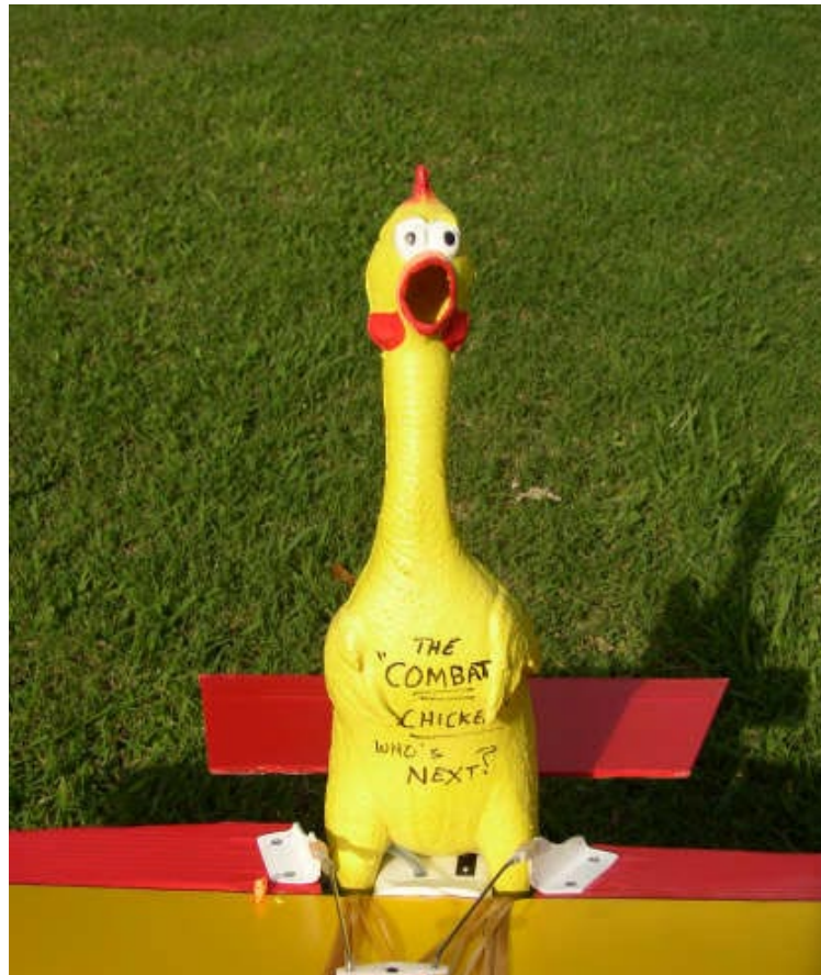
The Infamous Combat Chicken.....